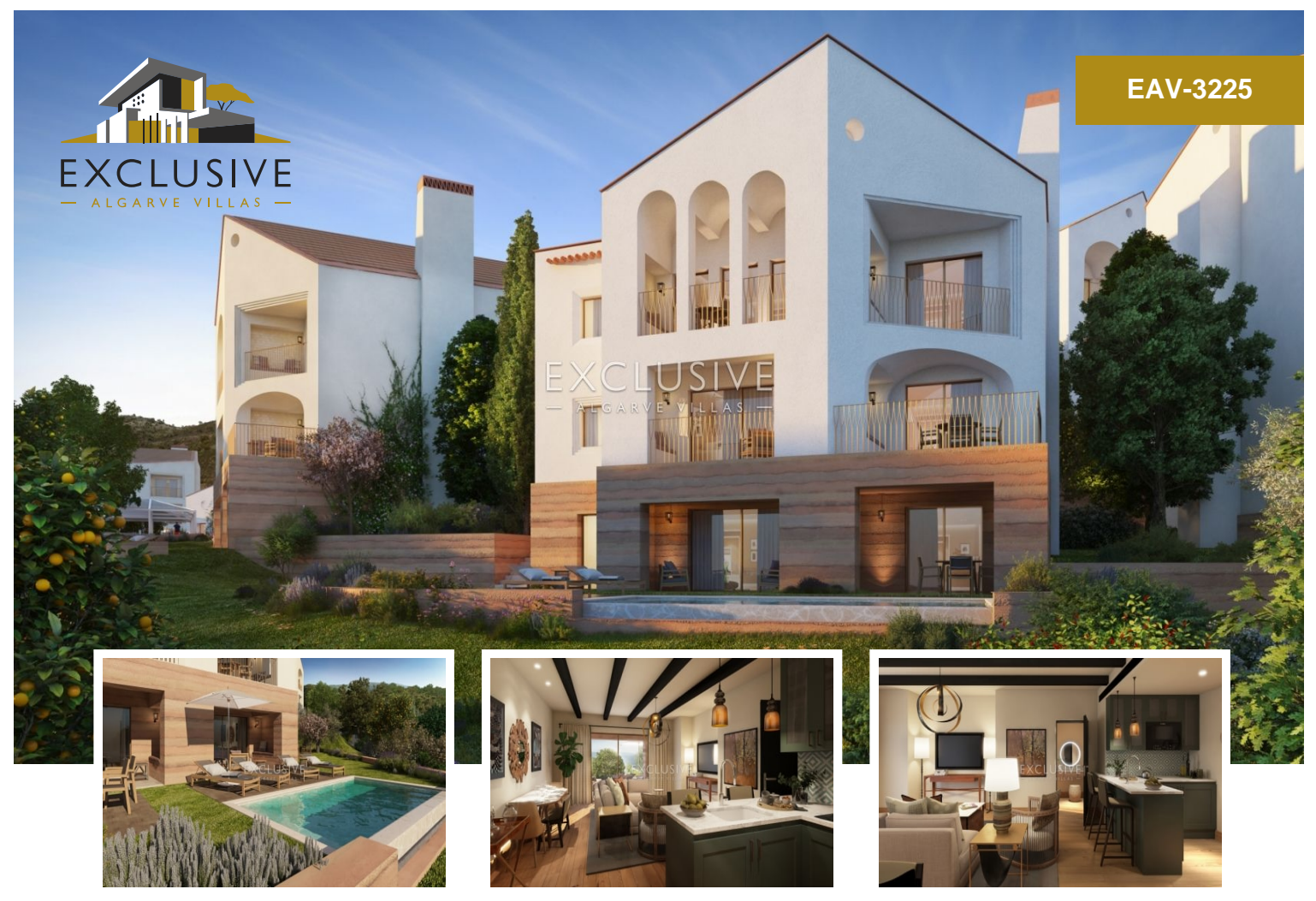
LUXURY SERVICED 2 BEDROOM GOLF APARTMENTS FOR SALE LOULE, ALGARVE