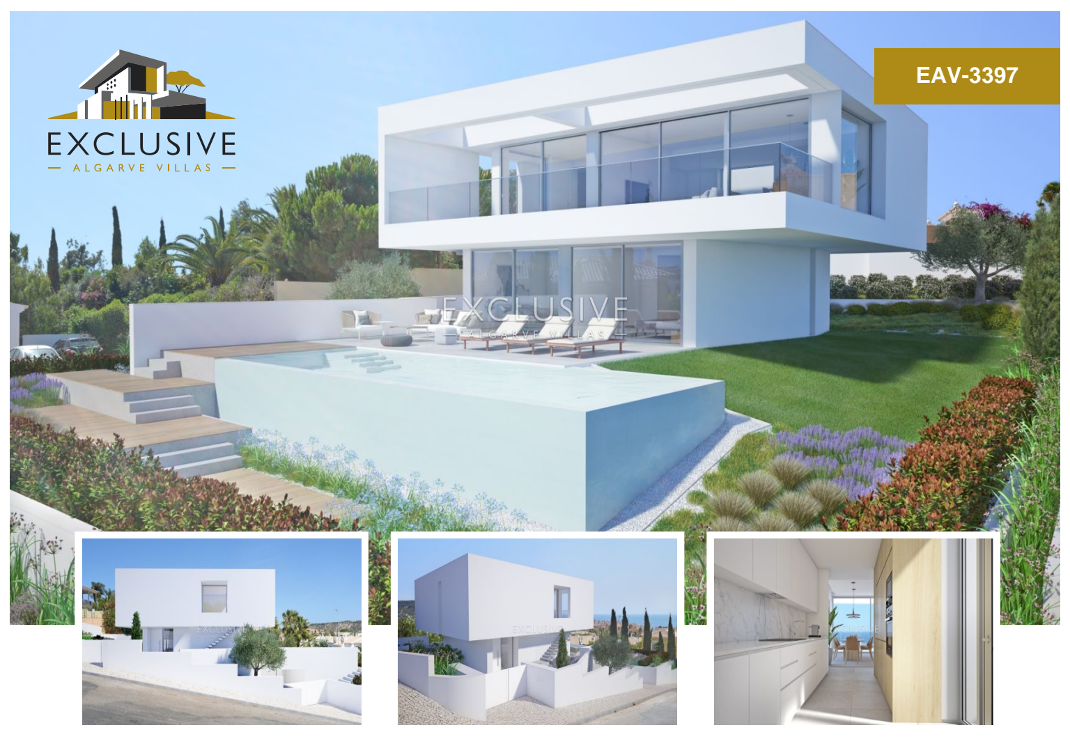
HIGH QUALITY MODERN DESIGN VILLA (IN CONSTRUCTION) FOR SALE IN LAGOS - LUZ